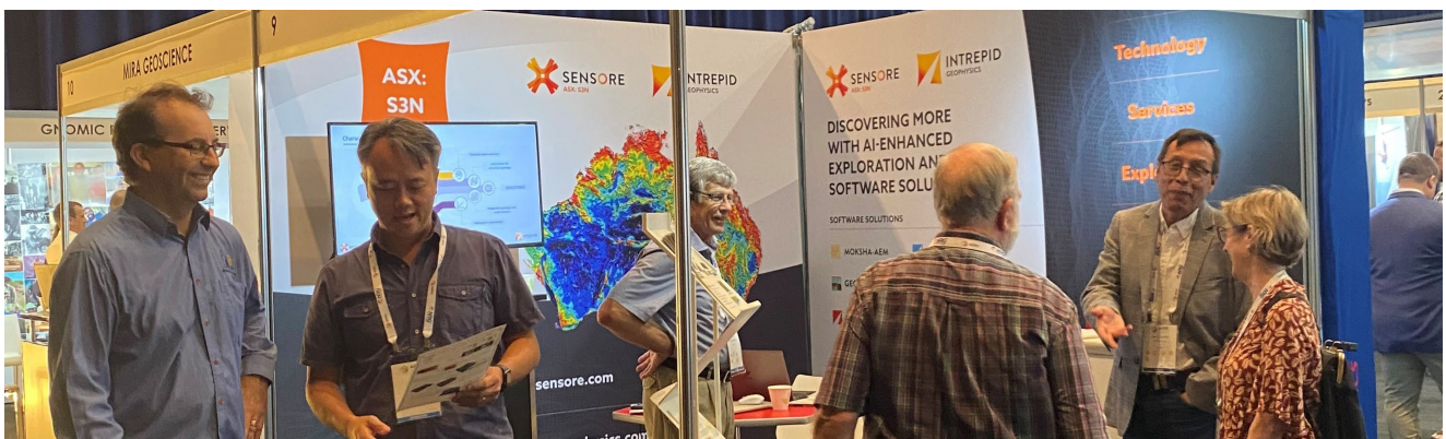
Figure 1: SensOre marketing at the Australasian Geoscience Exploration Conference AEGC (Brisbane) March 2023