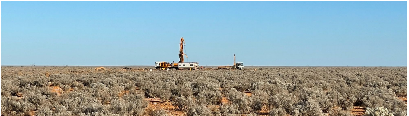
Figure 1: SensOre deployed technology on client and joint-venture projects across Australia in the June Quarter

SensOre (ASX:S3N) is pleased to present its quarterly activities report for the period ending June 2023.