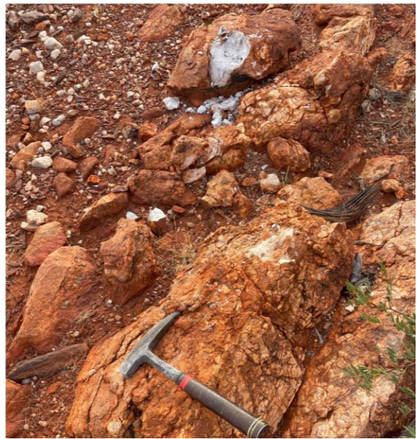
Figure 1 – EXAI Lithium pegmatite sampling at the Buttamah Prospect