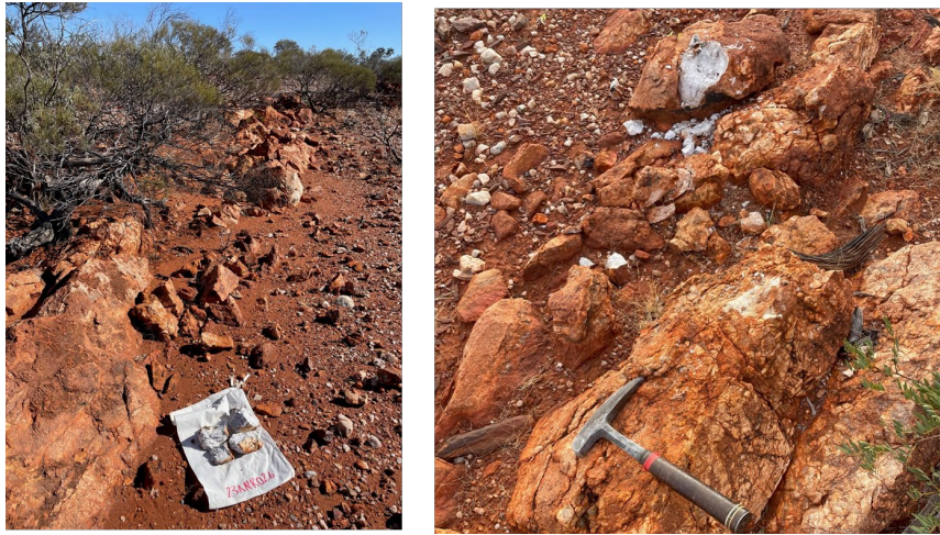
Figure 1: SensOre deployed technology in support of lithium exploration at Abbotts North

SensOre (ASX:S3N) is pleased to present its quarterly activities report for the period ending September 2023.